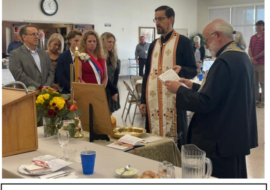
Kolo Slava, October 23, 2022

The BAZAAR is quickly approaching – SATURDAY , NOVEMBER 19 . (It's <u>always</u> scheduled the Saturday prior to Thanksgiving!) Bakers can bring their cookies to