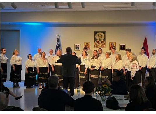
S.S.S. St. George Choir, Kansas City

On Sunday, October 30, we held a fundraiser for a portable refrigerator that can be used in our booth at the Ethnic Enrichment Festival that is held every August. We surpassed our goal of $1,200. Many, many thanks to everyone who donated! We appreciate your continued support!