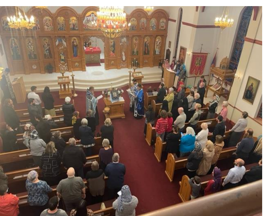
Facebook: St. George Serbian Orthodox Church Lenexa, Kansas